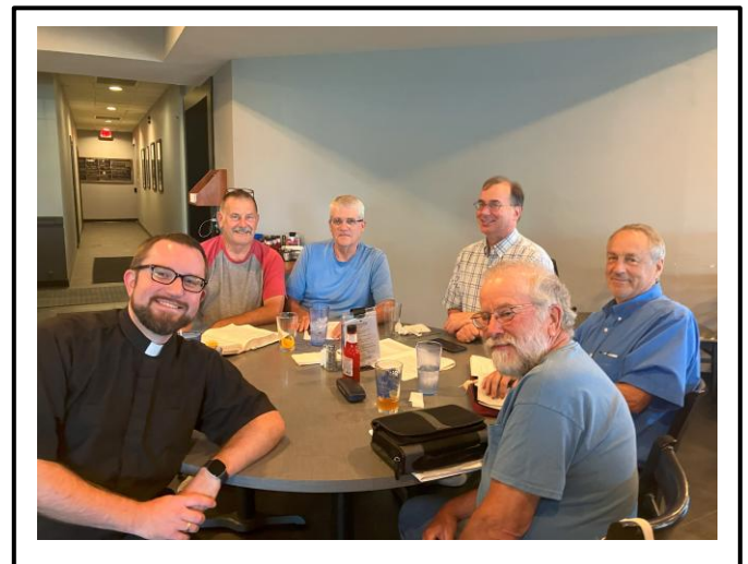
Men’s Bible Study, July 8 th , at Feature’s in West Salem.

John’s Gospel focuses beautifully on both the promise of everlasting life and the bodily resurrection of those who trust in Jesus. Throughout the study, we will take comfort in Christ’s many great and precious promises to His flock. His words are spirit, and they are life!